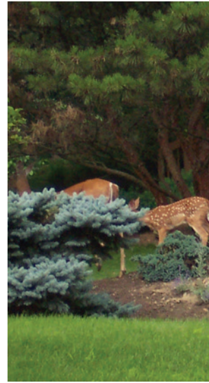
Deer can destroy gardens and land the deer tick.