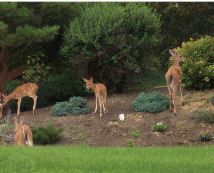
discarded areas on public and private property—and may transmit pathogens via /lorSxM

acceptable levels, or affect Lyme disease for that matter.”