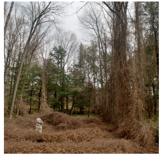
A. arguta mat and vines in winter