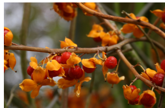
Asiatic Bittersweet | Celastrus orbiculatus