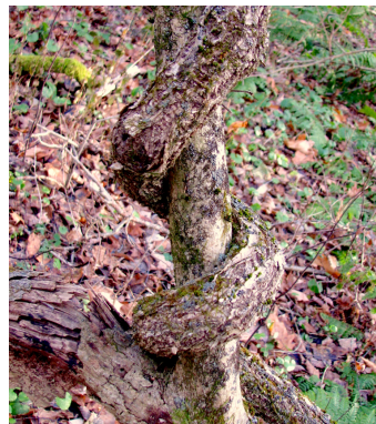
Wild Grape | Vitis species