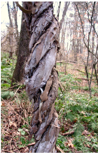
A. arguta mature vine

Hardy kiwi seeds are probably spread by racoons and other small mammals, as well as birds like wild turkey and ruffed grouse. Invasive hardy kiwi vine can grow over 20 feet per year. The vines suck up huge amounts of moisture during rainy periods in the summer and can hold large amounts of snow and ice in the winter. Both can cause the trees supporting the vines to bend and break. A. arguta can germinate under a closed canopy and grow as a ground cover. As the vine matures the mat can reach six feet high and completely out-compete other species. The mature vines climb surrounding vegetation, eventually pulling down trees and creating 'curtains' that hang from the canopy.